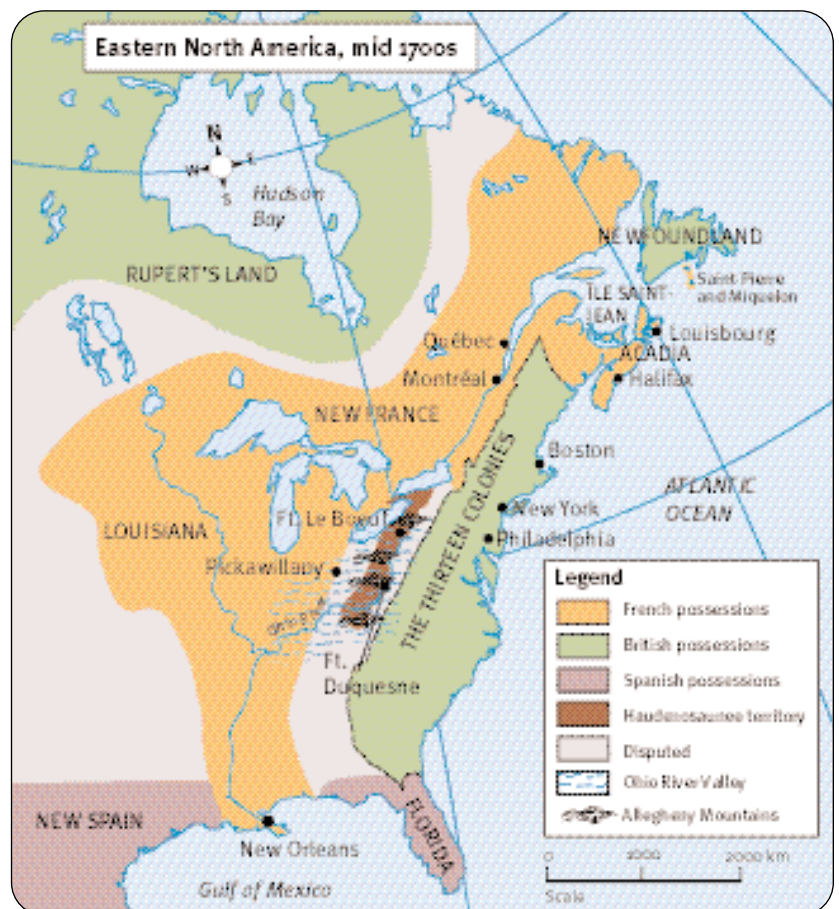
Figure 5.1 Eastern North America, about 1750. The grey areas are those territories that were in dispute. Why do you think the French and English both felt hemmed in? How would the Haudenosaunee [hah-duh-nuh-SAH-nee] feel about the tensions between the French and English?

The Canadiens were the Francophone citizens of Québec. A Francophone is a person whose first language is French. After the First World War, English-speaking Canadians no longer wished to be known as British subjects. They called themselves “Canadians”. That is when the term French-Canadian began to be used more often in referring to Francophones.