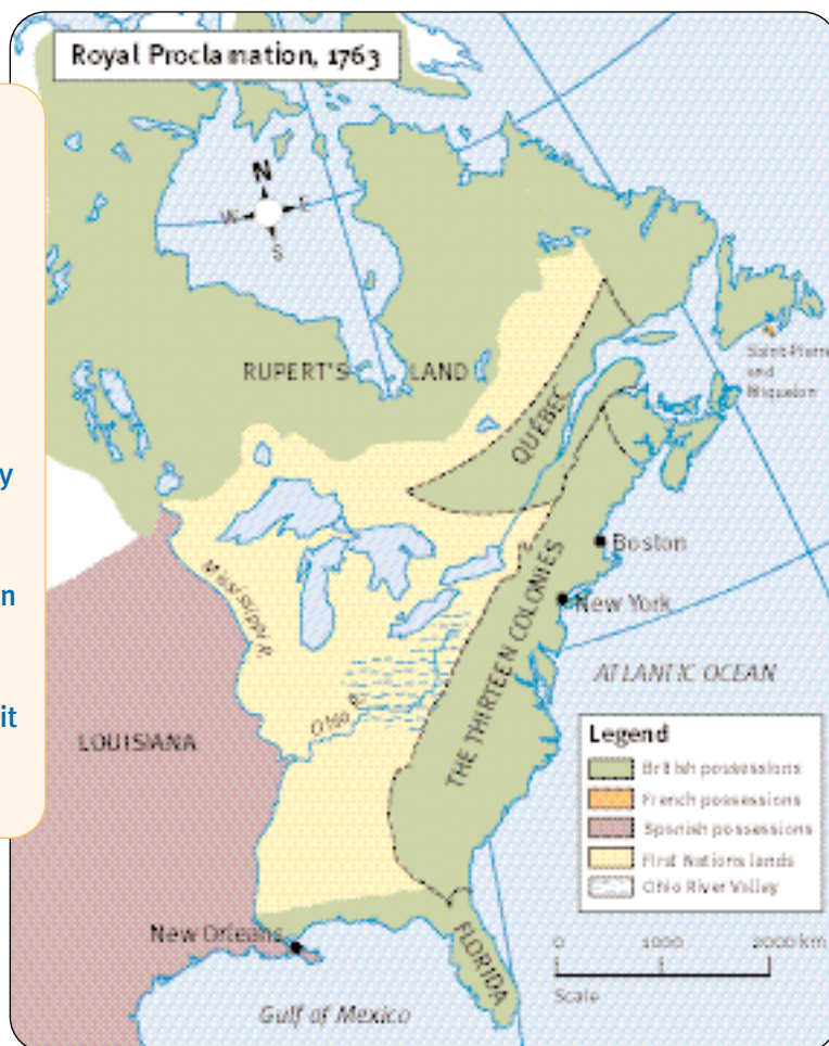
Figure 5.20 The Proclamation reduced the size of the colony to a small area along the St. Lawrence and Ottawa Rivers. Overall, do you think the British were fair? Explain.