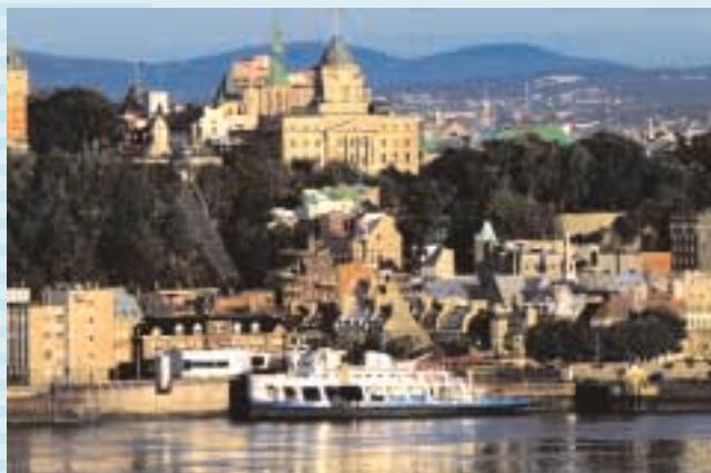
Figure 5.3 Québec, the only fortified city in North America, as it looks today. Why do you think the United Nations named parts of the Old City a World Heritage Site?