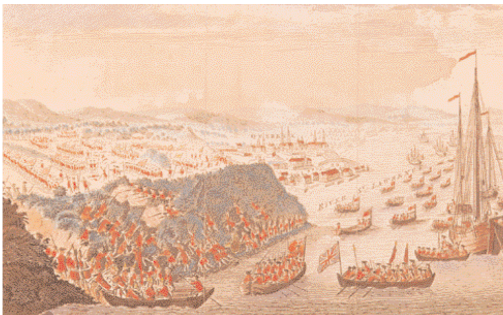
Figure 5.13 The events of the Battle on the Plains of Abraham, shown as if they were all happening at the same time. It is based on a sketch by Hervey Smyth. He was a British soldier who was wounded during the battle. Locate the following: the British fleet, the landing boats, the Plains of Abraham, and the town of Québec. What distortions in the painting might be a result of Smyth's bias? SKILLS

Plains of Abraham. When dawn broke, the French were astonished to see thousands of red-coated soldiers in battle position just outside the city gates.