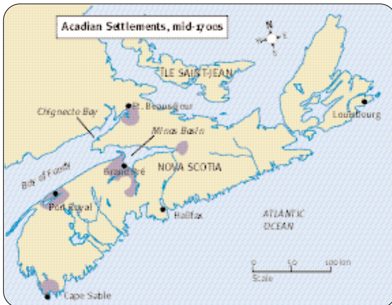
Figure 5.7 The main Acadian settlements around 1750. Think about Acadia's location. Why did both Britain and France want to control the colony?

In 1755, Lawrence gave the Acadians an ultimatum (a threat of serious penalties): swear your loyalty or lose your land. The Acadians did not want to fight. They wanted to remain neutral . They promised not to take up arms against the English, but they refused to take the oath. That set the stage for le Grand Dérangement —the Great Upheaval.