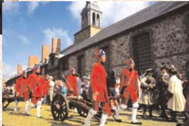
Figure 5.6 Activities at the reconstructed Fortress of Louisbourg. How would a local hotel operator, a Canadian historian, and a taxpayer each view the process of reconstruction? SKILLS