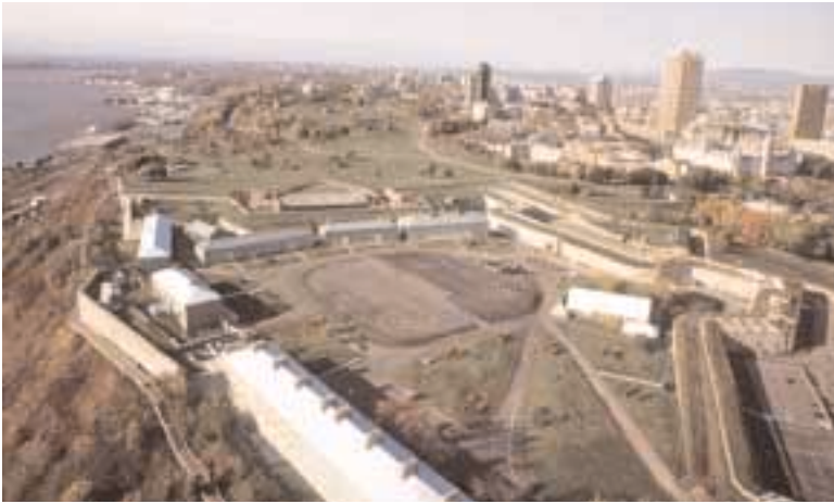
Figure 5.15 The Plains of Abraham as it looks today. In the nineteenth century, the British built the Citadel, which you can see in the foreground. In 1908, the National Battlefields Commission was created to preserve the site. Why would we want to preserve a battle site?

Following the battle, the English troops entered the city. “Québec is nothing but a shapeless mass of ruins,” reported one eyewitness. “Confusion, disorder, pillage reign even among the inhabitants.” French colonists and British soldiers alike scrambled to find food during the winter. More British soldiers died from disease than had died in the battle.