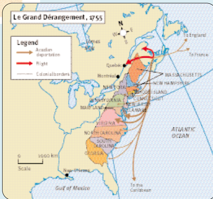
Figure 5.10 Destinations of the Acadian deportees in 1755. Le Grand Dérangement can also be translated as “the Great Bother.” What comment do you think the Acadians were making when they labelled such a tragedy with that phrase?