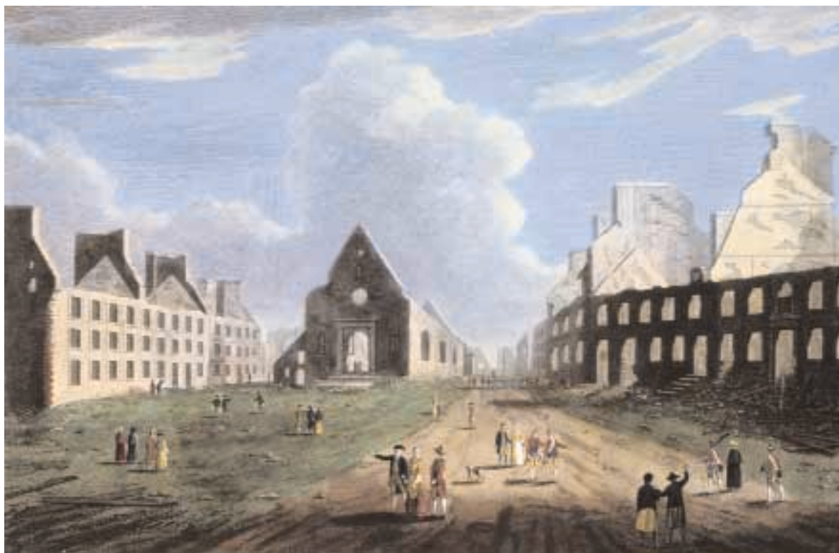
Figure 5.18 A painting of Québec in ruins by Richard Short, who was a member of the invading British forces. What aspects of the painting create mood? The war brought devastation to both the city and the countryside, where many farms were destroyed. What effect does war have on civilians?

The new British rulers faced challenges, too. They now had a colony of 70 000 people who spoke a different language and practised a different religion. The Canadiens had a different form of government, followed different laws, and had different ways of doing things. The English were worried about the First Nations, too. Many of them had been allies of the French during the war. How were the English going to make the Canadiens and First Nations peoples loyal subjects of the British Crown?