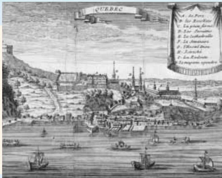
Figure 5.2 Québec in 1720. Think about ways that paintings and drawings could be used as sources of information at that time.

Québec lay at a narrowing of the St. Lawrence River. It was the gateway to the colony. All ships coming up the river had to pass within range of its cannons. The French were confident that no enemy could overcome its defences.